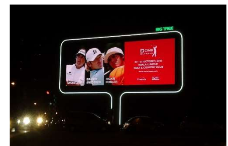
CuBIG Digital Series, Bangsar Shopping Complex