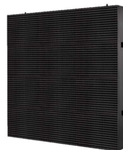
Panel: Side View