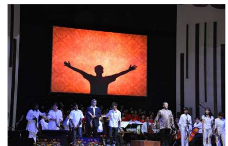
Grace Convention Centre