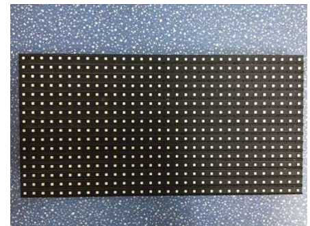
Module: Front View