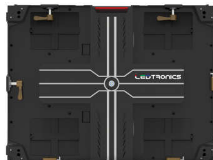
Cabinet: Rear View (convenient in handling and during installation, with less structure and wall load requirements)