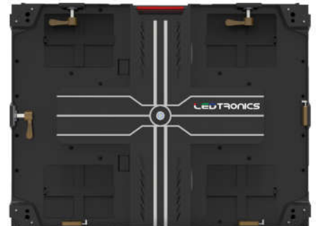
Cabinet: Rear View (convenient in handling and during installation, with less structure and wall load requirements)