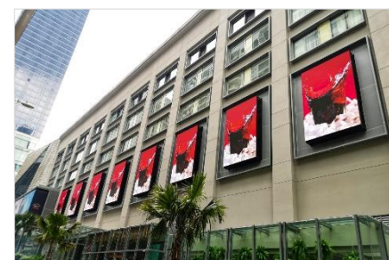
Starhill Shopping Mall, Jalan Gading